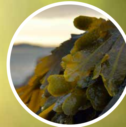
Finely ground, prior to compounding in products